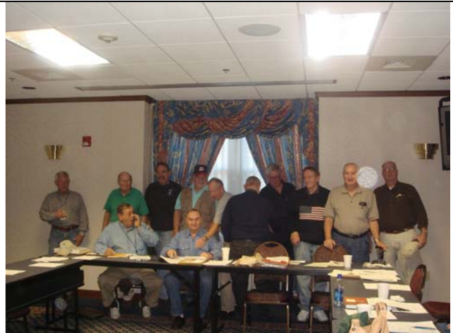
The new Advisory Council which you members elected formed up to be sworn in for their three year term of 2008-2010