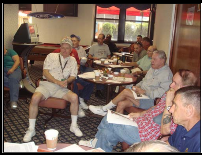
The Executive Board/Advisory Council October meeting held in the Canopy Lounge.