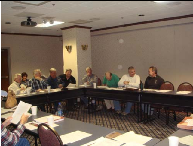
The Executive Board/Advisory Council January meeting held in the Canopy Lounge.