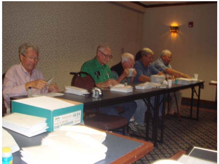
Part of the crew are stuffing the envelopes and sealing them for mail.